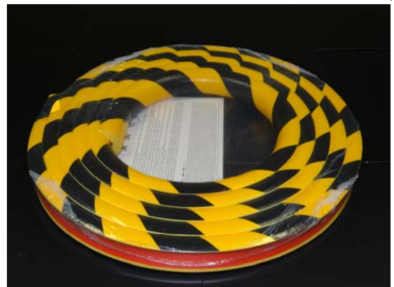
16 feet are rolled into a tight Coil for ease of shipping